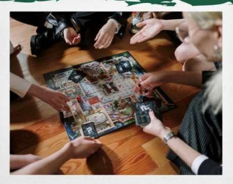
Board games, books & crafts

Free pop up community event for everyone! Tuesdays from 9.00 am - 1.00 pm St Francis of Assisi RC Church, Warwick Rd, CV8 1HL