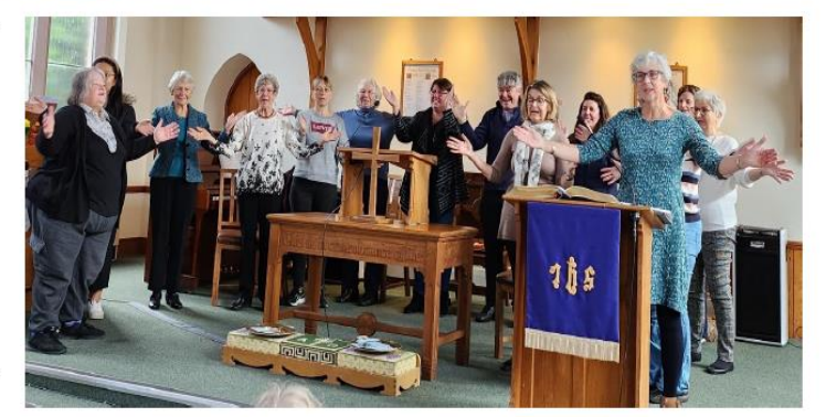
BSL group leading the congregation in signing to All Things Bright and Beautiful.